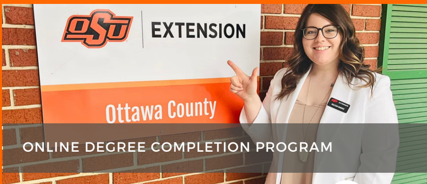
ONLINE DEGREE COMPLETION PROGRAM