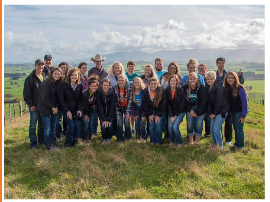
Students from the Oklahoma State University Department of Animal Science on a study abroad trip to New Zealand

The two week trip was filled with educational visits to farms, purebred stud operations, agricultural industries and tourist attractions across one of the most beautiful countries in the world. Students visited New Zealand dairy farms, beef units, sheep farms and red deer operations during their trip. Along with local hotels, the students stayed one night with host farm families. Read more about their study abroad trip by going to the students' blog at <a href="http://ansinz2016.blogspot.com/">http://ansinz2016.blogspot.com/</a>.