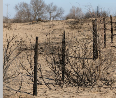
Emergency Conservation Program (ECP)