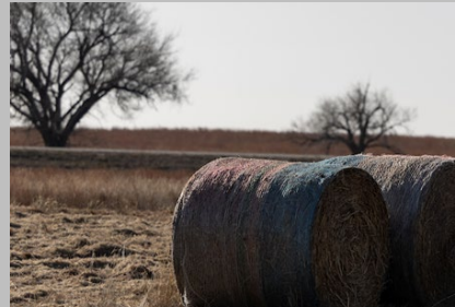
Emergency Assistance for Livestock, Honeybees and Farm Raised Fish (ELAP)