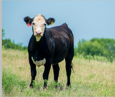
Livestock Indemnity Program (LIP)