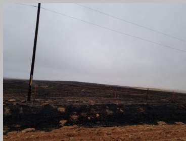
Environmental Quality Incentives Program (EQIP)