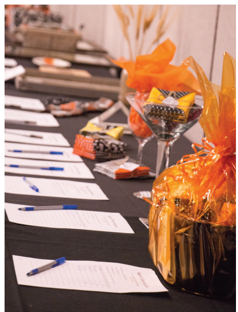
For the first time ever, Aggie-X Club officers and members organized a silent auction to raise funds for the club.