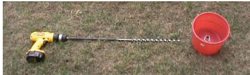
Figure 1. The sweatless soil sampler developed by the Soil, Water and Forage Analytical Laboratory at Oklahoma State University.

The Sweatless Soil Sampler (SSS, shown in Figure 1) reduces the amount of work and time needed to take a soil core. This makes it easier to take more cores per sample and gives you a composite sample that better represents your field. The SSS also makes it easier to mix your soil plugs in the bucket since they are already broken into small pieces.